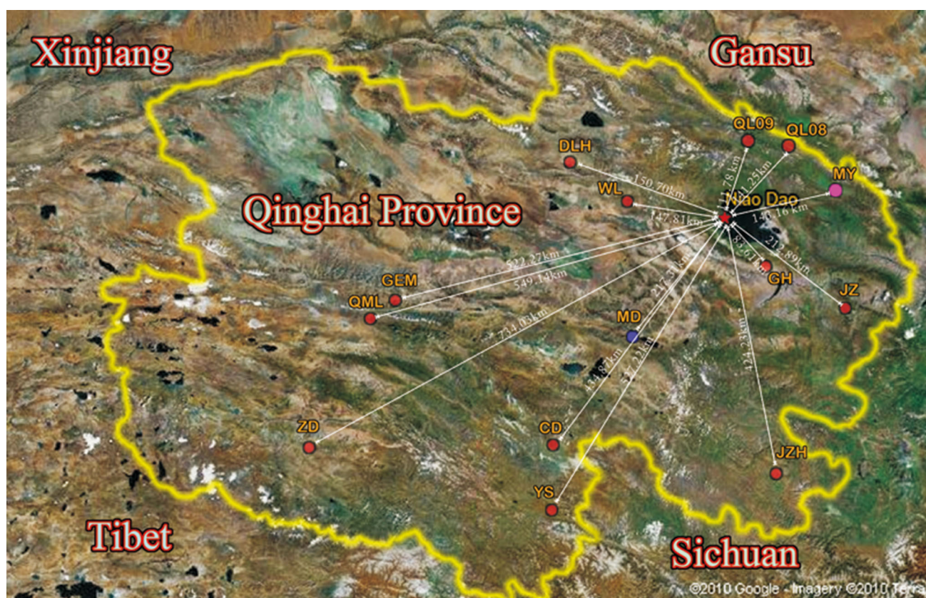
Fig. 1 Plateau pika sampling sites in Qinghai Province, China, between 2008 and 2009. Round red symbols indicate sites of pika sample collection. The pink point indicates the site of the isolated H9N2 virus. QL, Qilian; WL, Wulan; DLH, Delingha; GEM,

Only one virus was isolated from 817 tissue samples collected from 138 pikas. The virus was isolated from the kidney tissue of one pika in Menyuan County of Qinghai